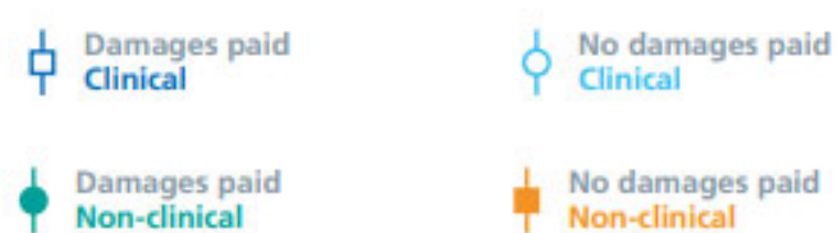
Figure 5 is missing the following key: